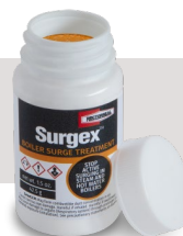
Surgex™ Steam Boilers Only