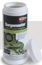
Surgemaster™ Steam Boilers Only