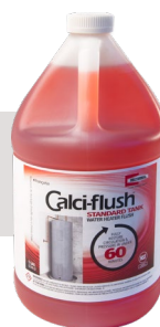
Calci-flush™ Tanked Water Heaters