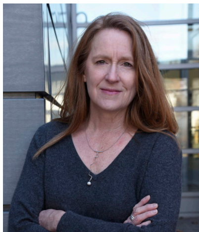
Featured in October 2023