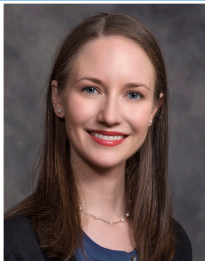
Featured in June 2023