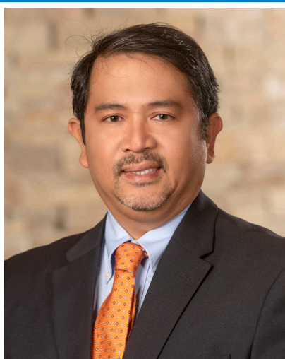
Featured in July 2023