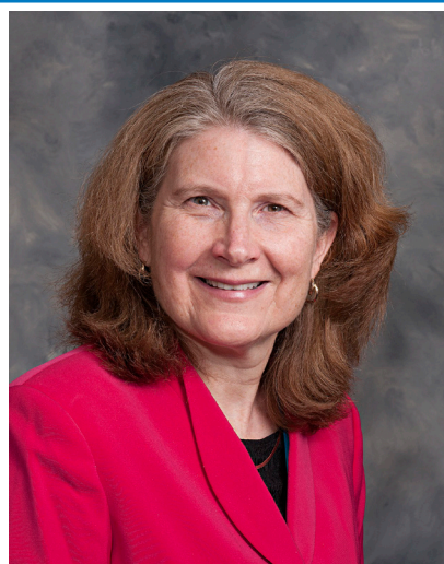
Featured in August 2023