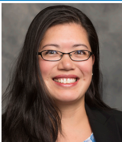
Featured in December 2023