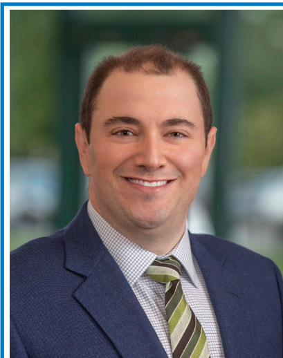
Featured in May 2023