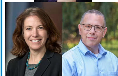
Featured in October 2023