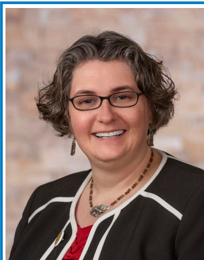
Featured in March 2023