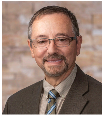
Featured in December 2023