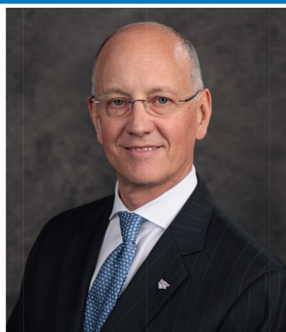
Featured in September 2023