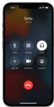
Direct audio streaming From iPhone, iPad or Android™ smartphones