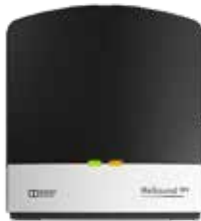
ReSound TV Streamer 2 For hearing great TV audio