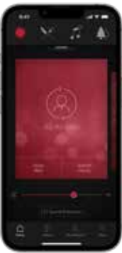
ReSound Smart 3D app Access to controls at all times