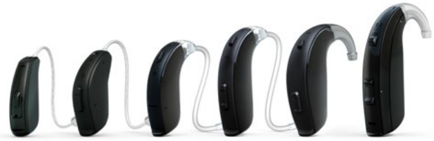
RIE and BTE Colors