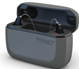
Premium Charger available for ReSound Key