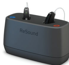
Desktop Charger available for ReSound Key

** Compatible with Android smartphones that support direct Android streaming to hearing aids.