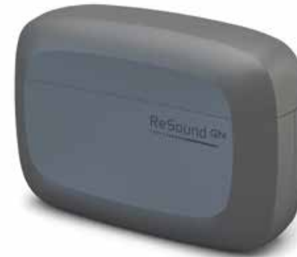
Premium charger C-1