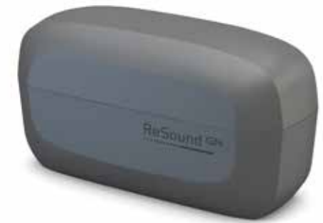
Standard charger C-2