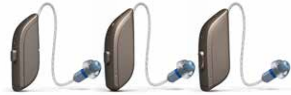
RT61-DRW RT61-DRWC RT62-DRW