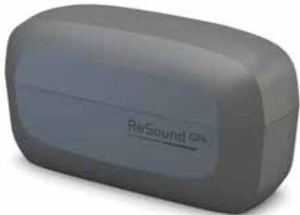
Standard charger C-2