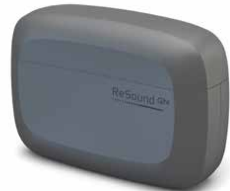
Premium charger C-1