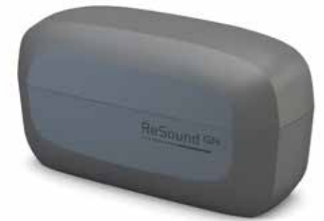
Standard charger C-2