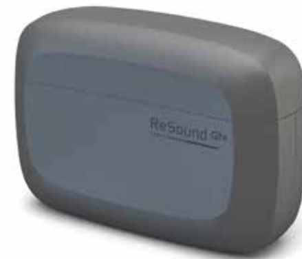
Premium charger C-1