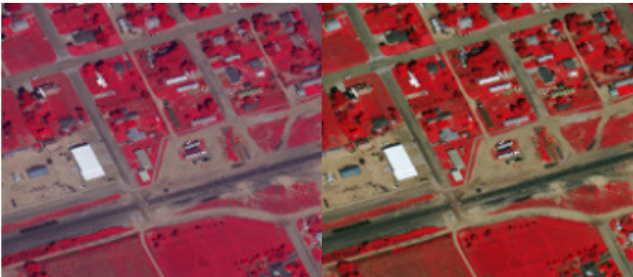
Before and after AComp processing