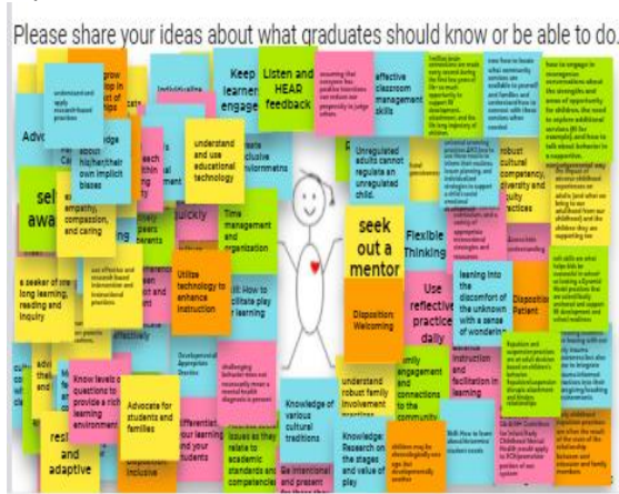
Here's what the product looked like on Jamboard (130 entries)

You can learn more about the Graduate of the Future activity at https://scriptnc.fpg.unc.edu/sites/scriptnc.fpg.unc.edu/files/resources/Blueprint%20narrative%20FINAL_14.pdf