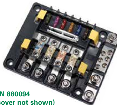
PN 880094 (cover not shown)